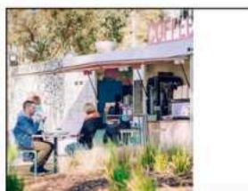
Cafe and Social Seating