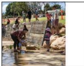
Native play integrated with water play