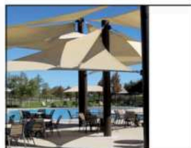
More shaded areas