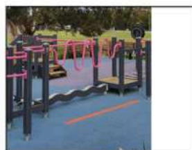
Fitness Station for Young People to Seniors