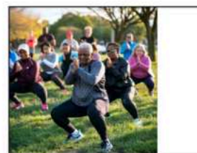
Outdoor Group Fitness Sessions