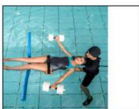
Warm water/hydrotherapy section of pool

What would you like to see at the pools?