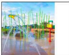
Water Play area with splash pad and sprays and jets